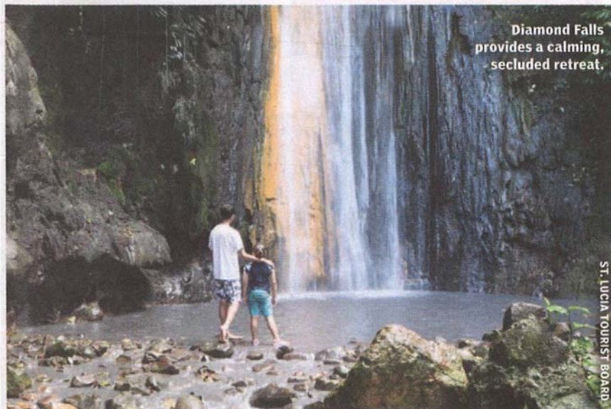
Diamond Falls provides a calming, secluded retreat.

And when you return to your hotel room, you'll have a newfound appreciation for that chocolate mint on your pillow.