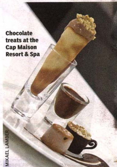
Chocolate treats at the Cap Maison Resort & Spa