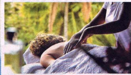
Chocolate spa treatment at Boucan by Hotel Chocolat (also at right). Yes, chocolate lotion is used in the massage.