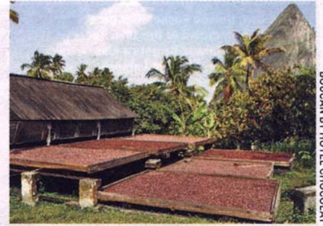
BOUCAN BY HOTEL CHOCOLAT