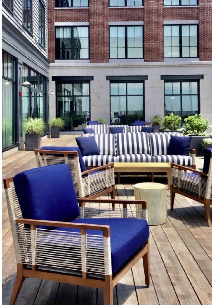
Hammetts Hotel in Newport, R.I.