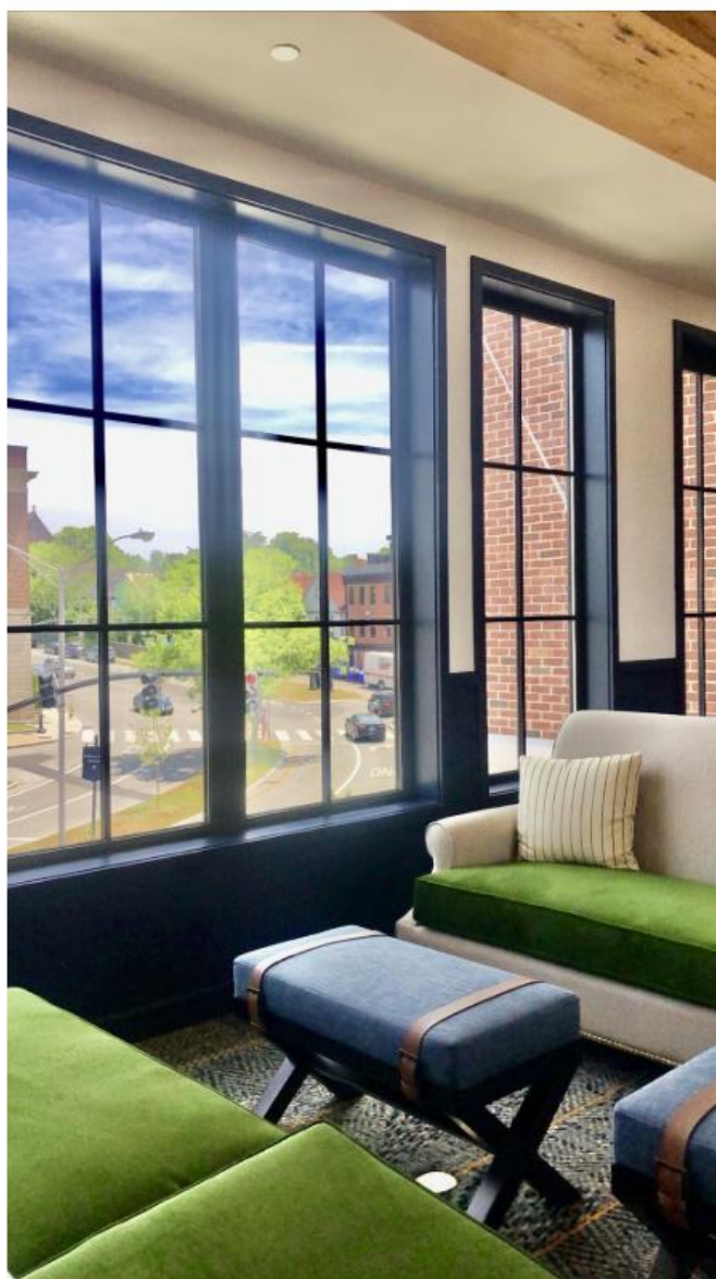
Hammetts Hotel in Newport, R.I.

Opening this summer gave Hammetts a chance to incorporate all kinds of pandemic protocols from day one. Currently, Hammetts staff members are masked and occasionally behind glass partitions. Prior to opening, they trained in the art of smiling with their eyes and using alternative methods of communicating hospitality, like their voices and body language. Hammetts partnered with Blue Canary, a company that trains hotels in hospital-level cleaning methods and conducts regular check-ins. As part of their new procedures, housekeeping will be in the rooms for longer periods, using stronger disinfectants.