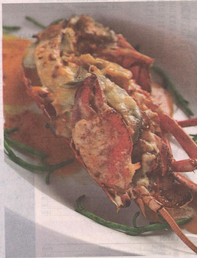
Lobster Thermidor is one of Maine's delicacies on the menu at Ocean, in the Cape Arundel Inn.

The 28-room Cape Arundel Inn is the closest hotel to Walker's Point — and those ocean views are exquisite — but it's not the only option. The Grace White Barn Inn and Spa is the ultimate in cozy chic, and its stunning dining room, set in an antique-filled barn, has won the