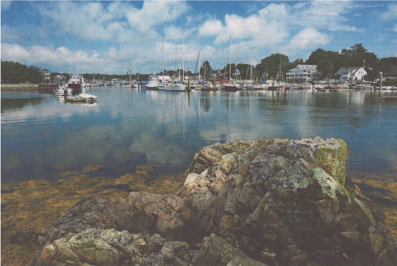
The beauty of Kennebunkport, Maine, comes to the forefront when the crush of tourists dies down.