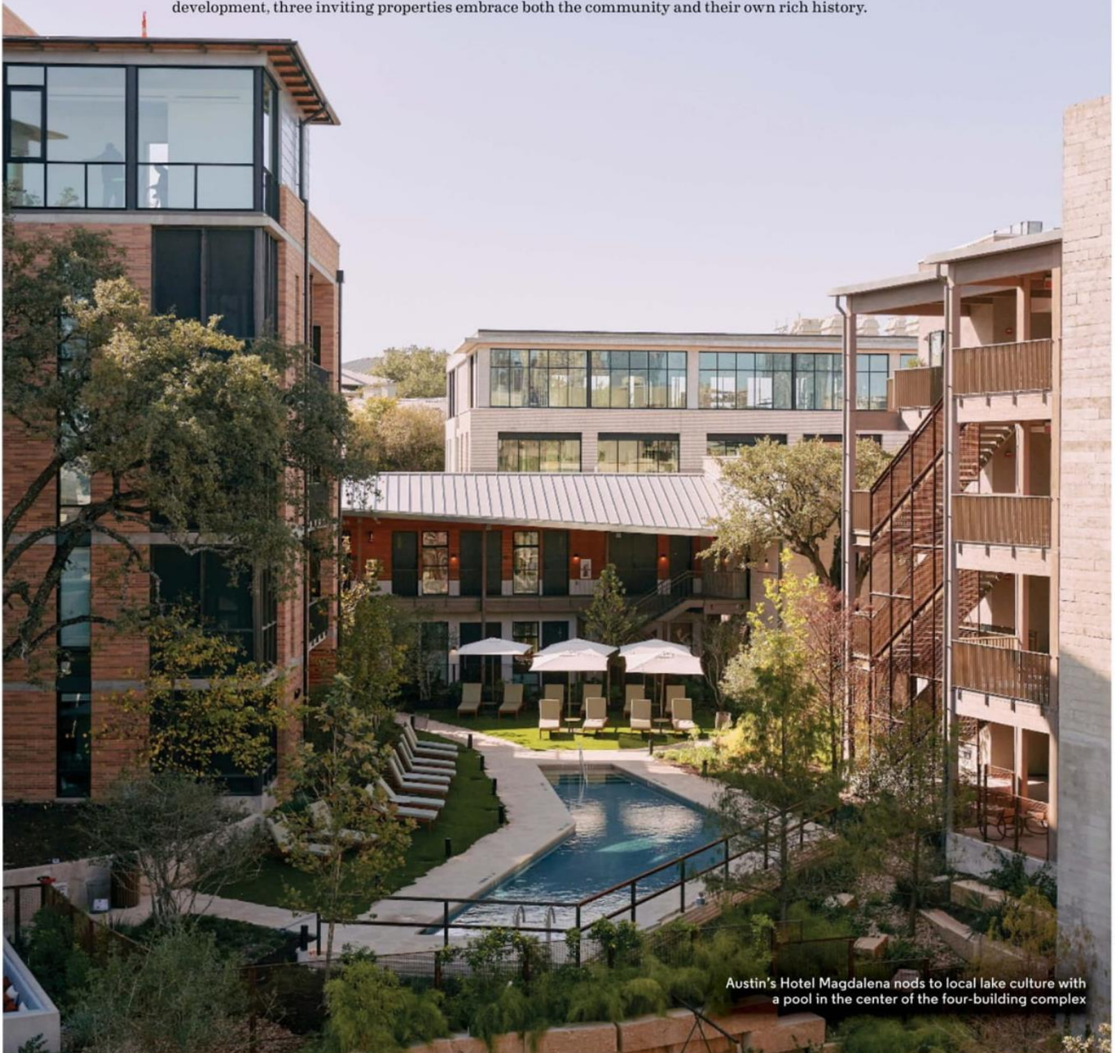
Austin's Hotel Magdalena nods to local lake culture with a pool in the center of the four-building complex

While major urban hubs in the U.S. like New York, Miami, and Los Angeles naturally get the lion's share of attention, secondary cities have their own growing appeal. Take Austin, which continues to be the city of the moment. Big brands and developers have staked a claim in recent years, but the originator of Austin cool, Bunkhouse Group, endures with laidback properties that cement the Texas capital as a must-visit destination. On its heels are coastal settings like Charleston, South Carolina and Newport, Rhode Island. Each exudes an effortless charm that attracts hoteliers and designers alike. In these cities that are ripe for development, three inviting properties embrace both the community and their own rich history.