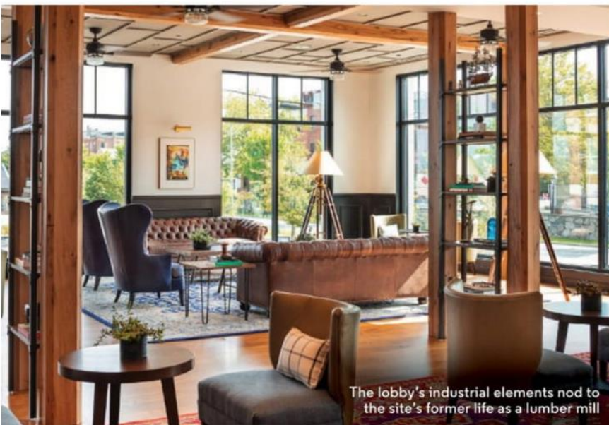
The lobby's industrial elements nod to the site's former life as a lumber mill