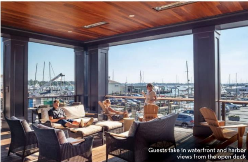
Guests take in waterfront and harbor views from the open deck