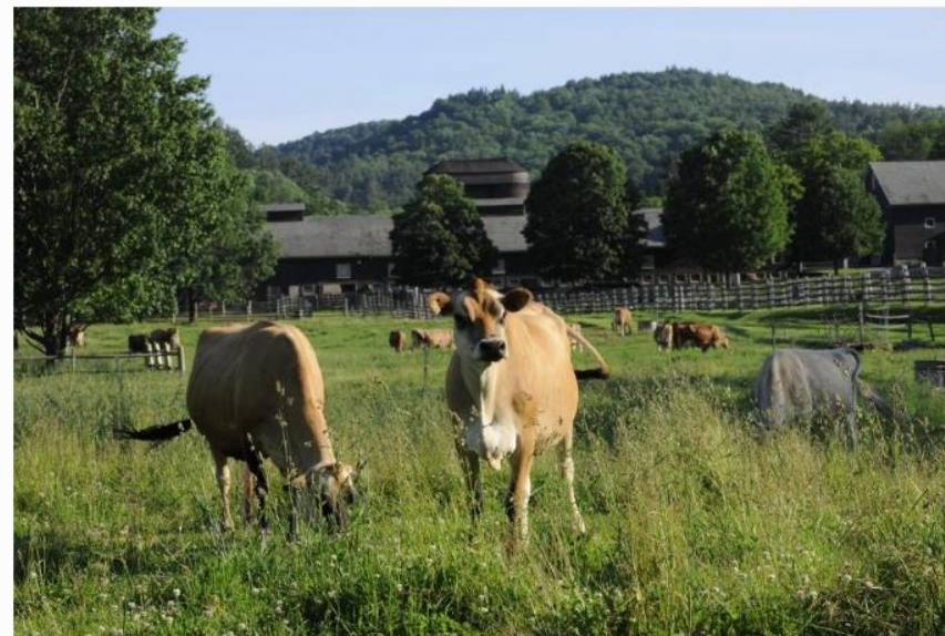
Cows in pasture at Billings Farm & Museum, Vermont

For most people anxious to get away this summer but still uneasy about flying, one of the safest ways to avoid crowds is to take a road trip. Many hotels have opened up (a few never closed) completely sanitized and safe for the most squeamish visitors. Discover an off-the-beaten path attraction or well-known National Park, but whatever you choose, pack sterile gloves (for handling gas nozzles), sanitizer and face masks. You'll get the most out of your getaway if you choose destinations in compliance with COVID-19 safety and physical distancing guidelines. Here are some reopenings for both day trips and longer stays which will safely and happily welcome you with open arms: