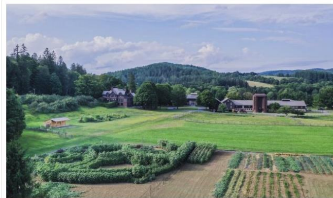
Billings Farm & Museum in Woodstock, Vermont

In the months since, Billings has leveraged its YouTube and Facebook channels to share sketching and art projects, offer book readings, lead farmhouse tours, and create virtual visits with the animals.