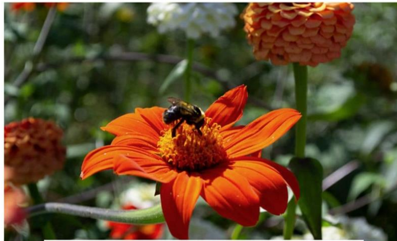
Learning about pollinating at Billings Farm & Museum.

We may be living in extraordinary times, but the travel industry is making huge efforts to help make life more enjoyable for parents and kids with virtual travel experiences — and to teach them something new at the same time. Family-friendly hotels, destinations, attractions and even sports teams are producing virtual travel content that will delight kids and parents alike. And the best part: It's all free. Here are some fun virtual travel and e-learning experiences that you won't want to miss.