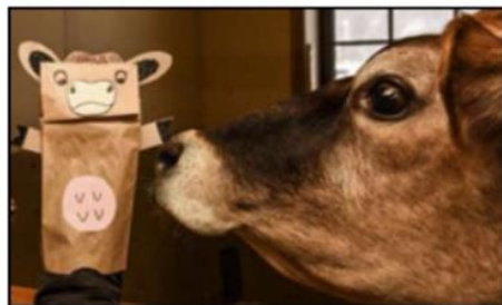
The “Dairy Cow Bag of Fun” feature on the Billings Farm & Museum website.

Send them ideas for future kits and videos,