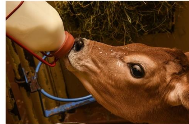
Kids can virtually meet fuzzy baby chicks, newborn calves, tiny lambs in sweaters, and watch and download content.

By Neece Regis Globe Correspondent. Updated April 16, 2020, 12:00 p.m.