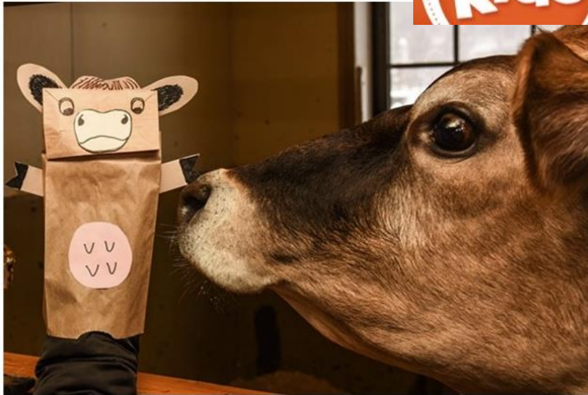
Billings Farm and Museum is offering crafts and activities "to go"