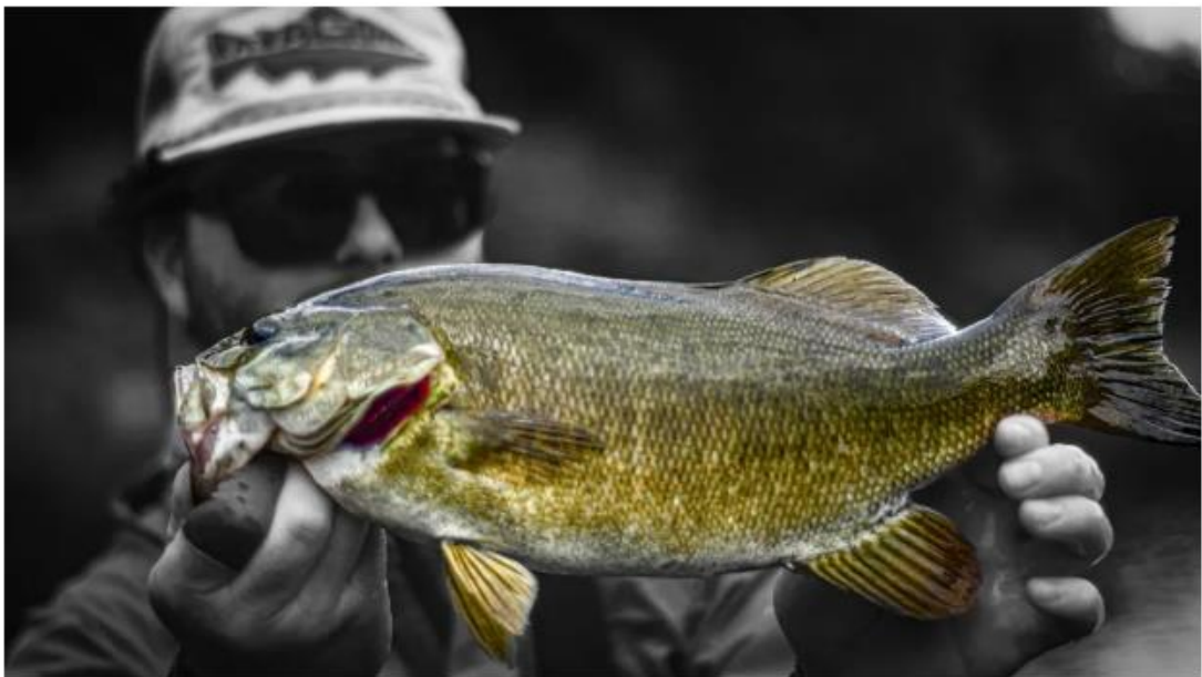
A nice-sized White River smallmouth.

My old man recently moved up to a little town outside of Woodstock, Vermont. I'm a good son, and I'd visit him no matter where he lived – but a mountain town surrounded by great fly fishing definitely sweetens the deal. Throw in a beautiful hotel with an Orvis-Endorsed fly fishing program , and he's going to be seeing more of me than he wants to.