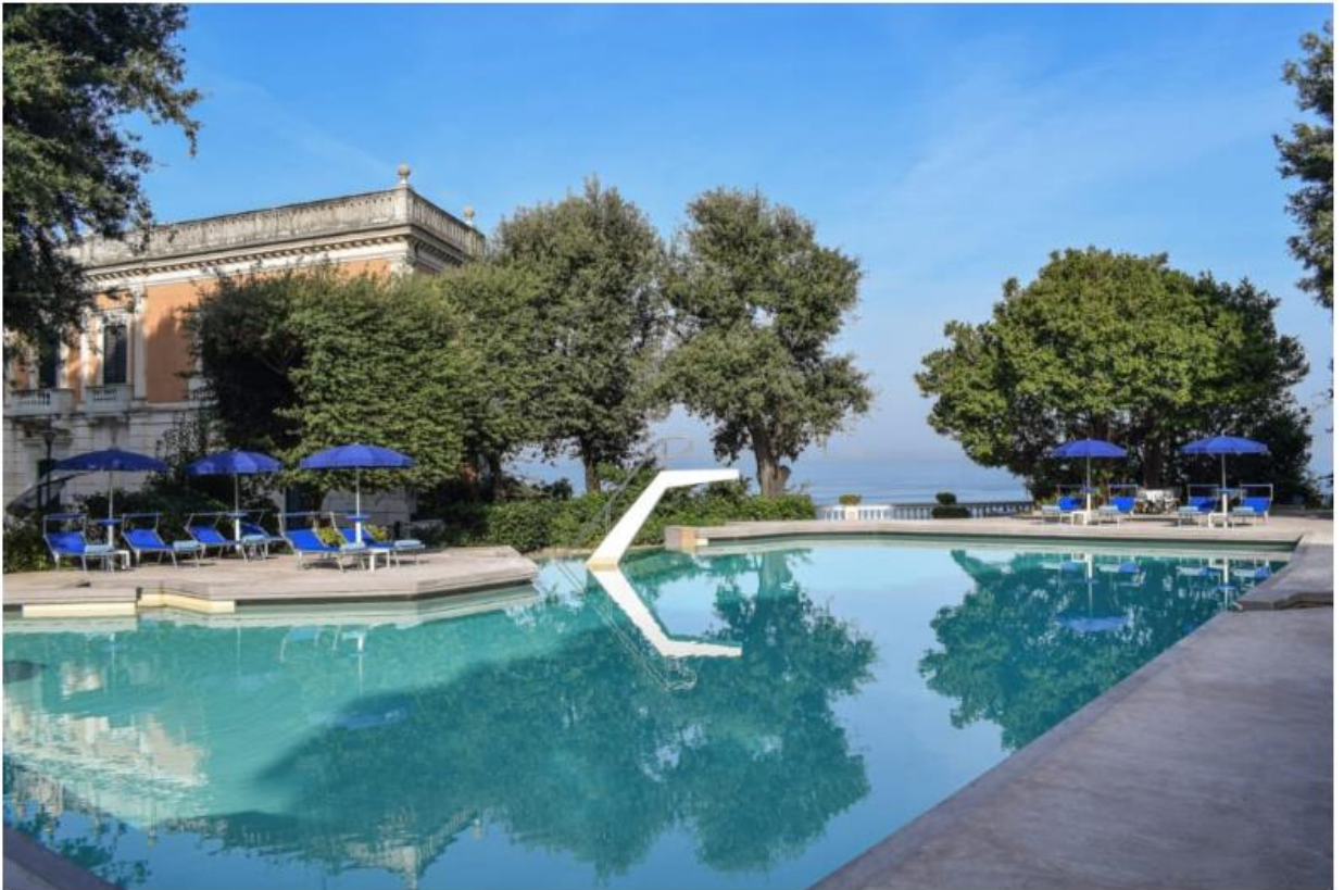
Parco dei Principi

It's a bastion of excellent taste in all respects, from the rooms to the bar and restaurant, the latter designed to "magnify the view of the sea with its wide spaces and the absence of walls." The food is both somewhat avant-garde and rooted in local tradition, with of course makes the most of the bounty of the ocean as well as other notable products of the region, all presented with a beauty suitable to the surroundings, plus a perfectly-curated wine list.