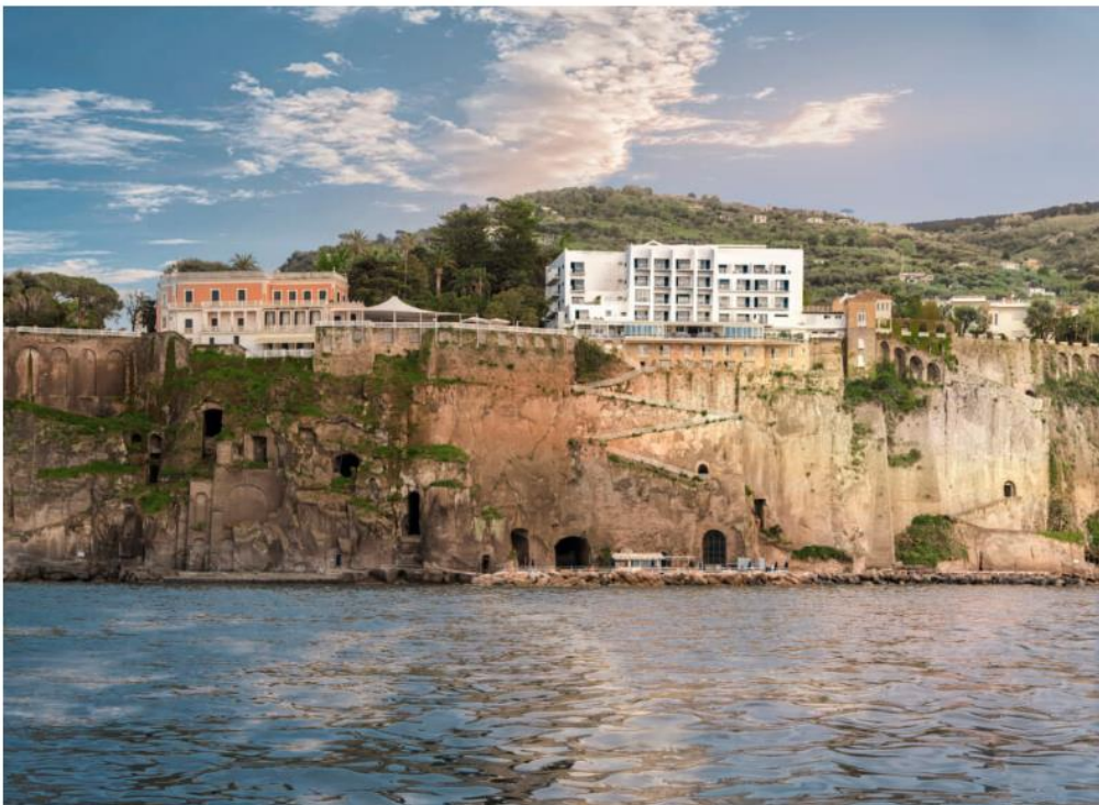
Parco dei Principi

“Italy is beloved for so many reasons,” he adds. “The incredible food, art, historical sites, charming small towns, beautiful coastlines—and after a long pause in travel, there is a lot of pent-up demand for this famously popular destination. Most travelers think Florence, Venice and Rome when it comes to Italy, but there are so many other beautiful, less traveled destinations within Italy, giving visitors a reason to go back again and again.” Starting with parts of the Amalfi Coast.