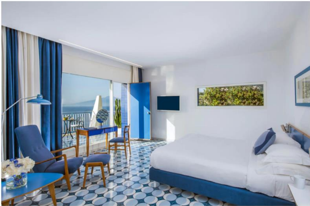
Parco del Principe

“The historical legacy [of the property], the extraordinary location, and natural colors inspired Ponti to create a structure rooted in the Earth,” perched on the cliff with its commanding view of the sea, as the hotel puts it. Once again we were in a privileged position thanks to Perillo, which had of course booked us one of the best rooms, with a balcony overlooking the wide expanse of ocean and the island of Capri offshore—the perfect perch for breakfast or an aperitivo after a long day sightseeing.