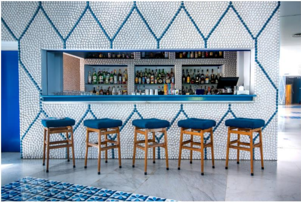
Parco dei Principi

Entirely designed in blue and white, with Ponti employing an endless variation of forms, shapes and furnishings—each of the 100 rooms has a different pattern of tile—it is a true design masterpiece, and probably should be a museum. Ponti custom crafted every single item in the hotel, from the furniture to the dishes and the light switches, all still in perfect condition, restored and maintained to the highest standards. The fact that you can eat, stay and play there is nothing short of astounding.